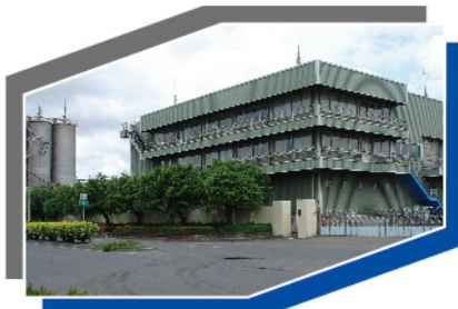
Kaohsiung Plant Office