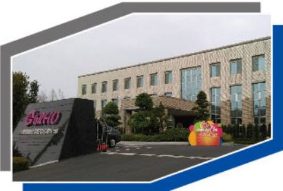
Great Eastern Resins Industrial CO., LTD.