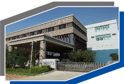
Great Eastern Resins R&D Center